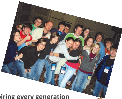
Inspiring every generation