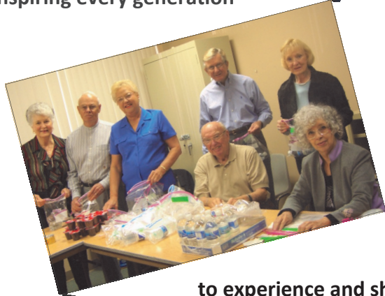
to experience and share